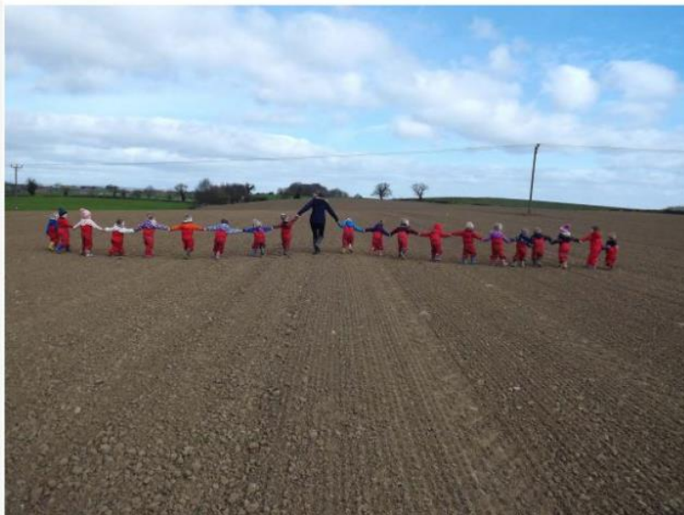
Children from Mini-Explorers Nursery